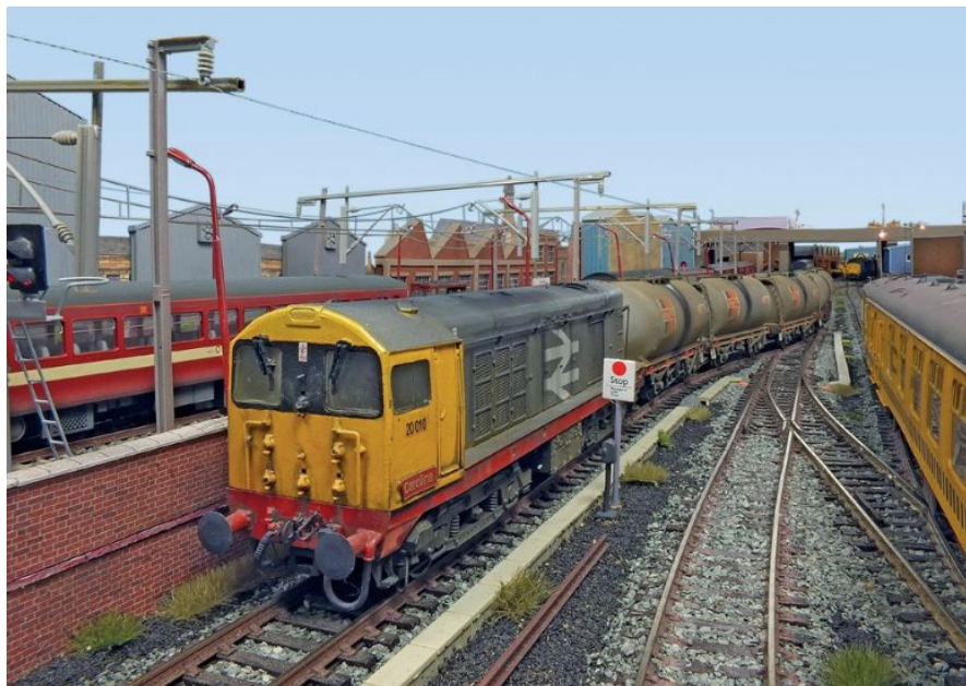
English Electric Type 1 20 101 Caroline is seen, unusually, running in single loco format as it departs with a rake of empty tankers. Note the seldom modelled trackside driver instruction board.

have been gradually building up a collection of departmental and engineering wagons for the layout, including a structure gauging train. For the most part these have been converted from ready-to-run items.