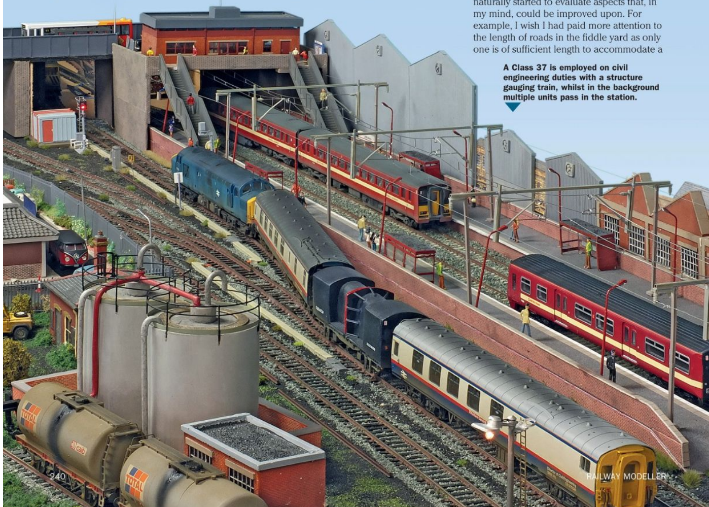
A Class 37 is employed on civil engineering duties with a structure gauging train, whilst in the background multiple units pass in the station.

We use the American Kadee magnetic coupling system for rolling stock at the wagon works, which enables hands-free shunting. For additional operational interest I